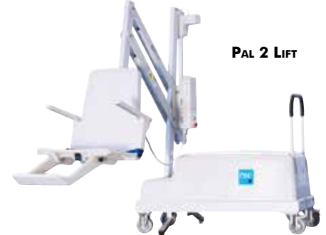
PAL 2 LIFT