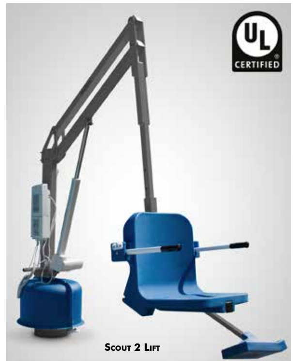
Scout 2 LIFT