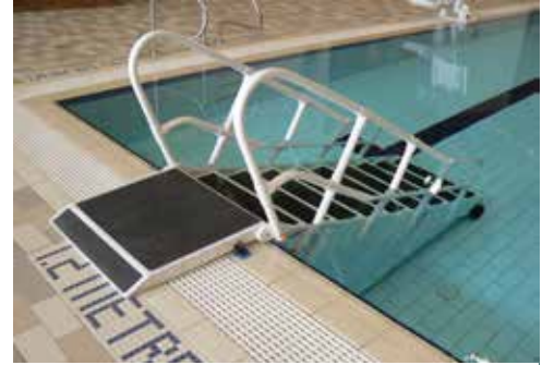
AQUA STEP HD