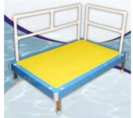
DELUXE TOT DOCK