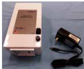
TRAVELER BATTERY 42693 AND CHARGER 42732