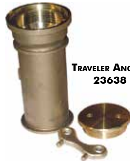
TRAVELER ANCHOR 23638