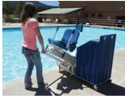
PATRIOT PORTABLE LIFT