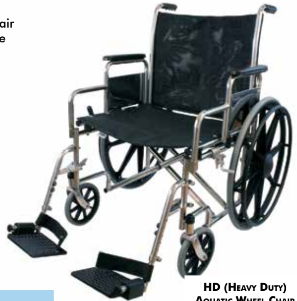
HD (HEAVY DUTY) AQUATIC WHEEL CHAIR