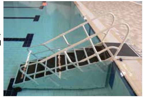
AQUA STEP HD