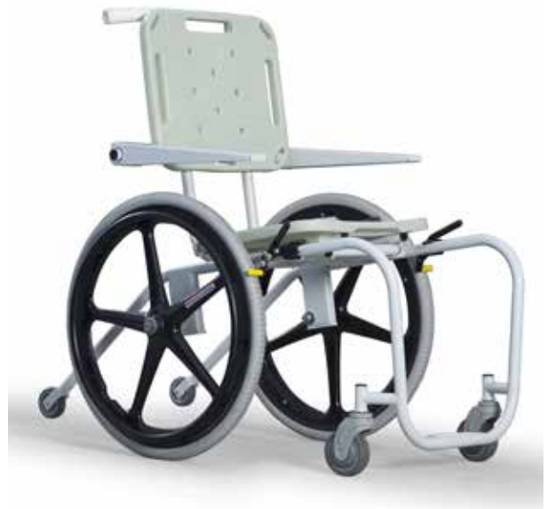
MOBILE AQUATIC CHAIR

Wheelchairs are tax exempt. For replacement parts list, please contact us.