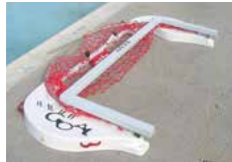
SPLASHBALL FLOATING GOAL - FOLDED