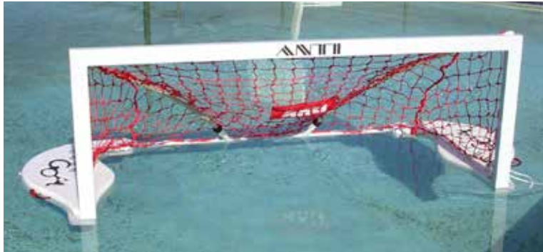
SPLASHBALL FLOATING GOAL