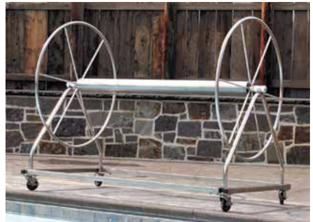
RECOMMENDED FOR POOLS USING SALT CHLORINE SYSTEMS