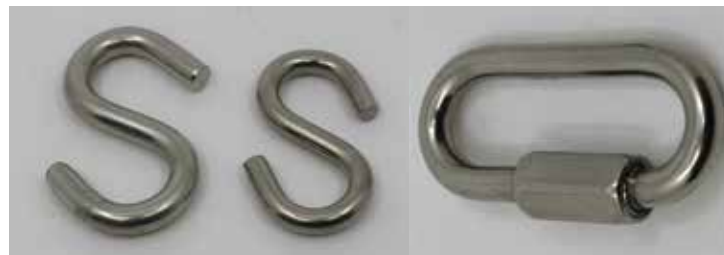
20 02 07 AND 20 02 14