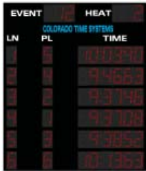
OTTER 6 LANE