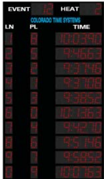
OTTER 10 LANE