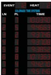
OTTER 8 LANE