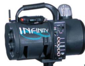
INFINITY START SYSTEM