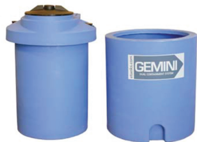
DOUBLE WALLED CONTAINMENT TANKS