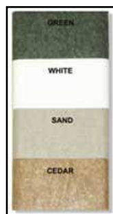
TAILWINDS COLOUR SAMPLES