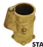
STANDARD WEDGE ANCHOR & ESCURTCHION