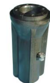
COMPOSITE 1.5 COMPRESSION ANCHOR