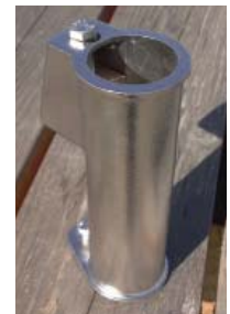
1.5 WEDGE ANCHOR