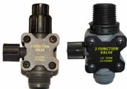
300 SERIES 3FV #38054