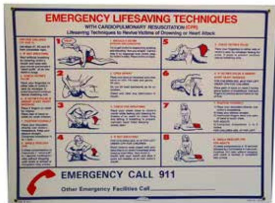
Item No. Description Price R231100 Emergency Lifesaving (18" x 24") $30.00