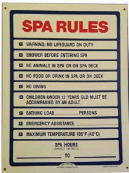
Item No Description Price R230300 Spa Rules (18" x 24") $30.00