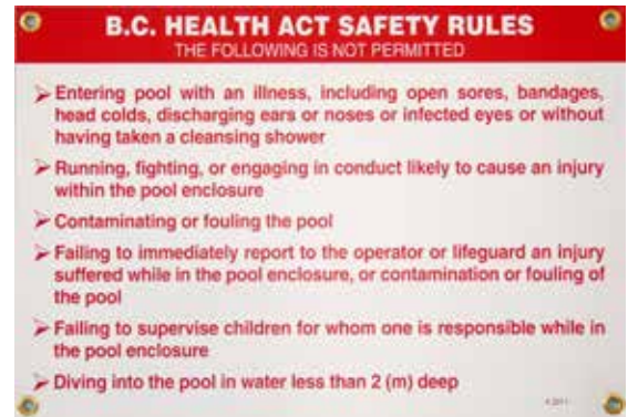
Item No. Description Price 18 11 06 BC Health Act New Rules (18 1/2" x 12 1/2"H) $62.75