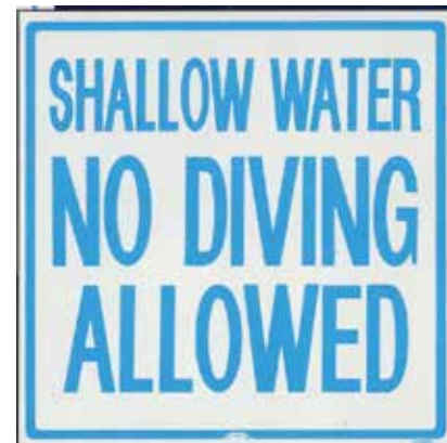
Item No. Description Price R233800 No Diving Allowed (24" x 24") $31.65