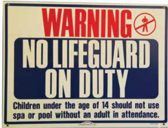
Item No. Description Price R230500 Warning No Lifeguard on Duty (18" x 24") $30.00