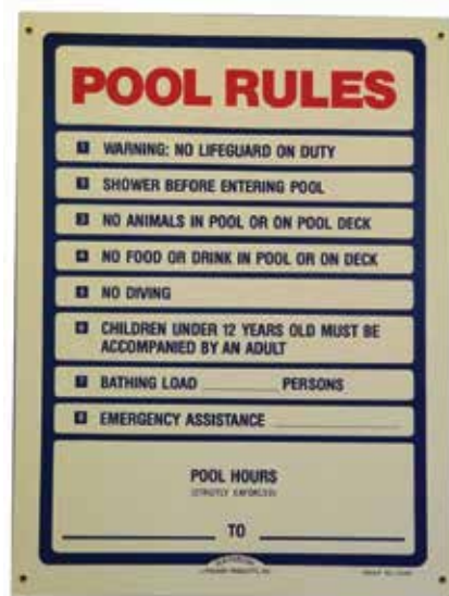
Item No Description Price R230400 Pool Rules (18" x 24") $30.00