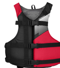
NEMO INFANT & CHILD PFD