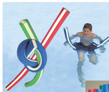
ROUND DELUXE SEA SERPENT WITH SWIMMER