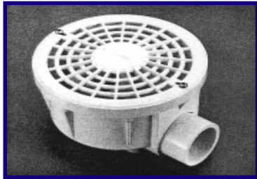
MO Drain Complete

Note: 18 x 18 frame uses four 9 x 9 grates.