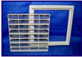
Hayward (grate fastens on 2 sides only)