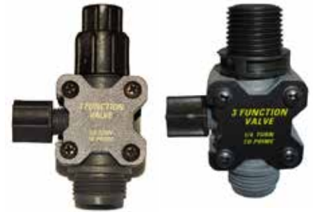
300 SERIES 3FV #38054