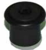
NEW STYLE 3FV #49148