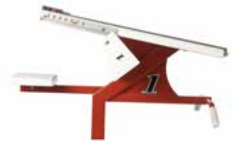
LEGACY LAUNCH WITH RJP