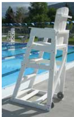
MENDOTA SIDE STEP