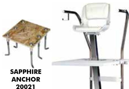
SAPPHIRE ANCHOR 20021