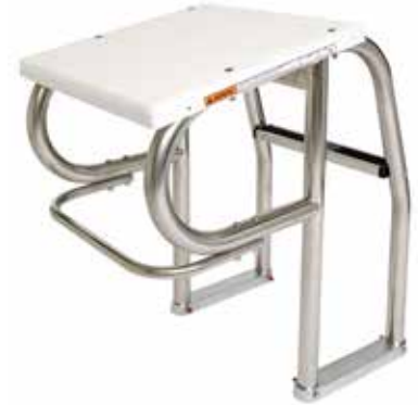
30" DELUXE STARTING BLOCK