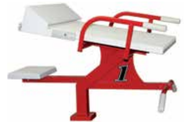
LEGACY LAUNCH WITH SIDE HANDLES