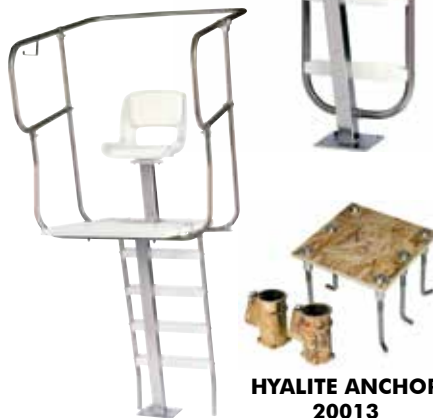
HYALITE ANCHOR 20013