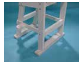
TAILWINDS LG50D CHAIR SHOWN WITH ANCHORING KIT