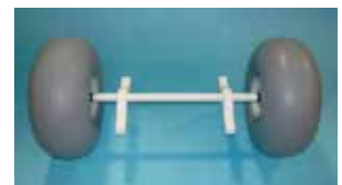
TAILWINDS BCWH 563