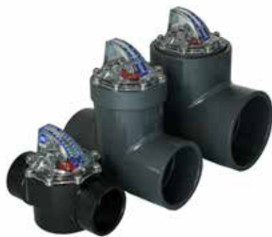
FLOWVIS FLOW METER