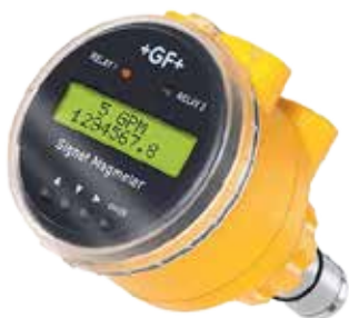
2551 FLOWSENSOR C/W DISPLAY & TRANSMITTER