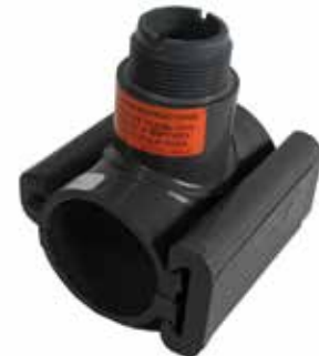
CLAMP ON SADDLE