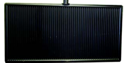
Generic 30 x 60 Element