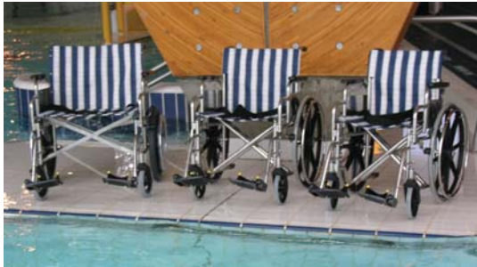
24 inch 18 inch 20 inch