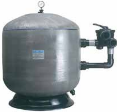
VERTICAL SIDE MOUNT SAND FILTER

Waterco makes a wide range of vertical and horizontal fiberglass sand filters, some of the most common are listed below. For Deep Sand Bed or Larger Diameter or Capacity Vertical or Horizontal Filters please enquire for a quotation and spec sheet. Waterco specializes in filament wound seamless one-piece fiberglass filters rated at 50psi, NSF 50 approved, and with Waterco's 10 year warranty, (5 + 5 pro rate).