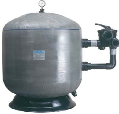
VERTICAL SIDE MOUNT SAND FILTER

Waterco makes a wide range of vertical and horizontal fiberglass sand filters, some of the most common are listed below. For Deep Sand Bed or Larger Diameter or Capacity Vertical or Horizontal Filters please enquire for a quotation and spec sheet. Waterco specializes in filament wound seamless one-piece fiberglass filters rated at 50psi, NSF 50 approved, and with Waterco's 10 year warranty, (5 + 5 pro rate).