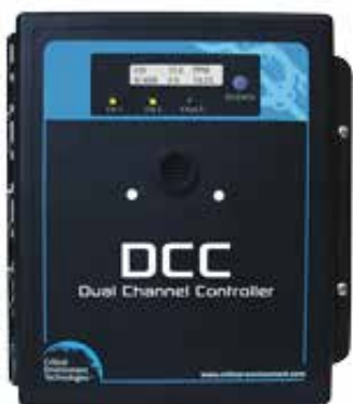
DCC GAS DETECTOR

DCC Chlorine gas detectors continuously monitor chlorine at one remote point. They incorporate a digital display (range 0-5ppm), an audible alarm with silence button, 2 alarm relays and the sensors are provided in watertite enclosures. The remote sensor has a water tight enclosure, audible alarm, 1 relay, digital display and power requirements are 110 volts. The alarm is two stage, warning and alarm.