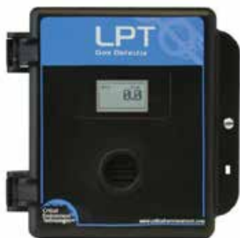
REMOTE GAS SENSOR